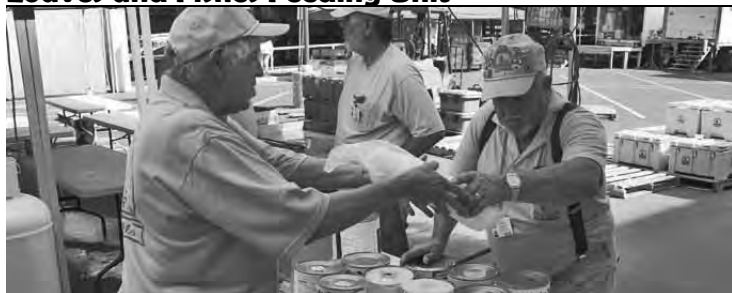
Feeding neighbors in times of disaster or celebration

“Taking the five loaves and the two fish and looking up from heaven, He gave thanks and broke the loaves...They all ate and were satisfied.” Matthew 6:41