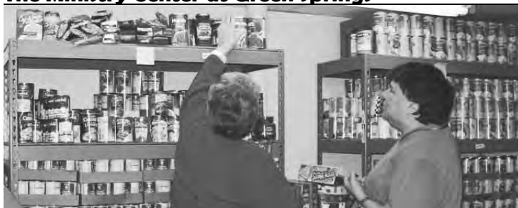
Services for the poor & multicultural communities

The Ministry Center at Green Springs, founded and led by several BBA churches, is a Christian nonprofit 501(c)3 that reaches out to those in need and to Birmingham’s multicultural community. We offer aid to ease the effects of poverty by seeking to address the human, social, and spiritual needs of people. Within close proximity of the Center many languages and cultures are represented. We offer a place for ethnic churches to meet and we offer programs to help immigrants and refugees become active members of their communities. We seek to embody the servant model of ministry by reaching out to people in love.